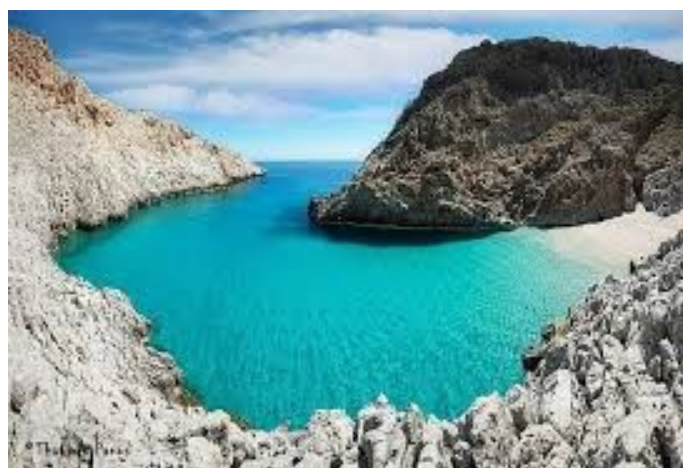
Seitan limania - Crete