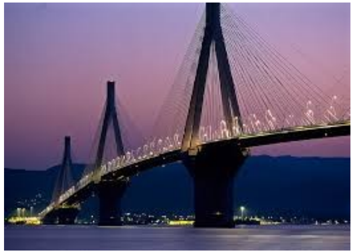
Patra – Rio bridge