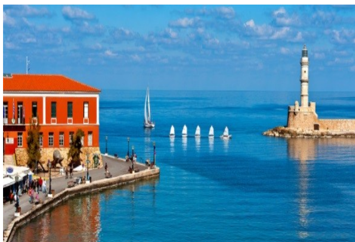
Chania - Crete