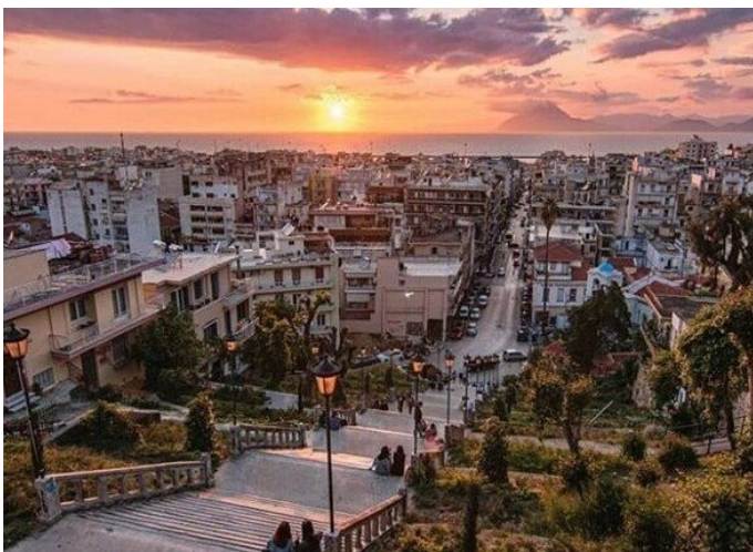
Patra - Skales Agiou Nikolaou

The OLYMPION patients enjoy advanced dialysis treatment against the backdrop of sites of unique beauty and history.